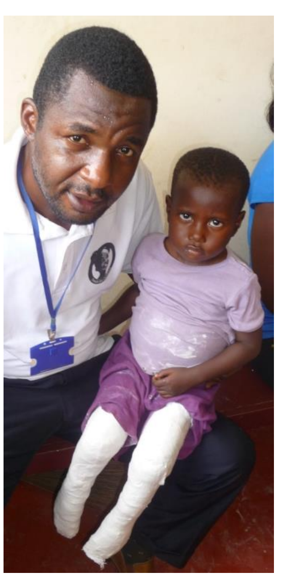
412 000 cfa = € 629,01